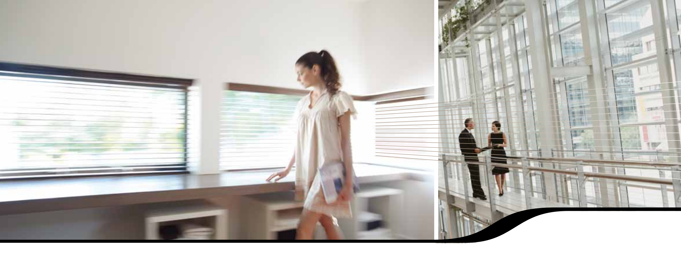
Sonesse^{\scriptsize{(\! f B)}} - The range of quiet motors

DESIGNED FOR ACOUSTIC COMFORT, DESIGNED FOR SUCCESS