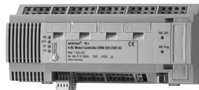
Ref. 1860081 (DRM)

Motor controller for roller shutters, screens, exterior Venetian blinds and windows openers.